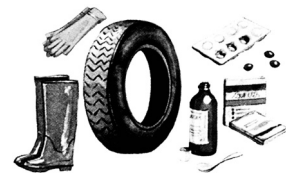
Rubber and many of our medicines come from the rainforests.

The rainforests are very important for us. We need them! The trees and other plants in the forest help to make the air that we breathe. They give us wood, rubber, fruits and many of our medicines.